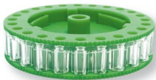
HORMONE INJECTION GUN CARTRIDGES