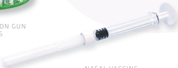
NASAL VACCINE DELIVERY TUBES

VETIMAX ® complex devices are used for vaccinating and inseminating animals (horses, dogs, cattle, etc.). These custom products have been developed in close partnership with our customers in the veterinary sector.