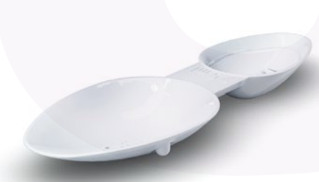
1BA DUAL-ENDED SPOONS