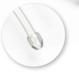
OLIVE Enables atraumatic and reliable insertion