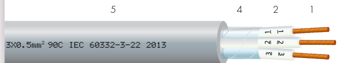
MULTIMAX CI: multi-conductor