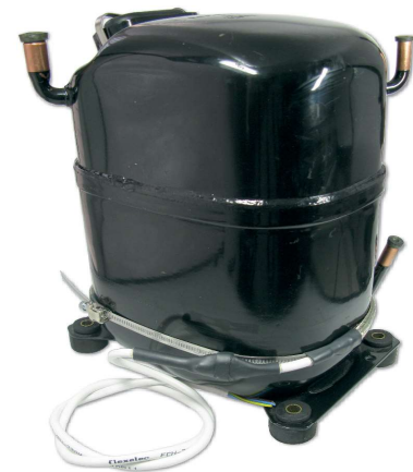
FCHK heating belt fitted on a compressor